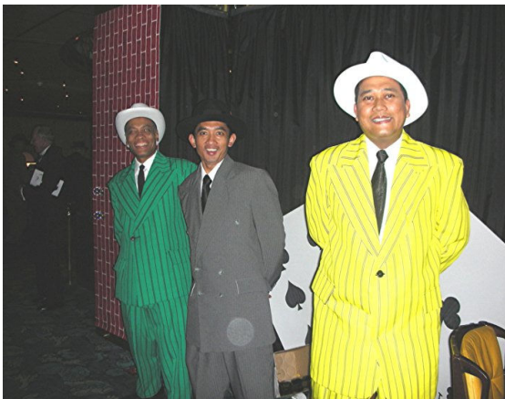
Head waiters ready for a rumble.